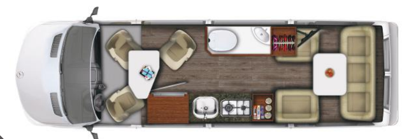
Interior floorplan of CS Adventurous during the daytime

Hit the road in your new CS Adventurous by Roadtrek. Enjoy luxurious heated flooring throughout your motorhome while you prepare a delicious meal on your 2-burner propane stove, and keep your groceries fresh in your 7 cu. ft. refrigerator. As you make your way through the galley, you'll find a permanent bathroom with stand-up shower, and finally arrive to your power leather sofa that converts into a king sized bed or two twin beds. End your day relaxed; watching your favorite movie on the 24" flat screen television.